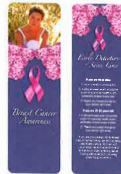
Breast Cancer Awareness (BCA)