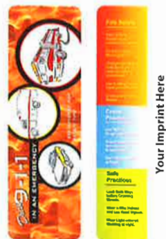
Emergency Safety Tips (EMG)