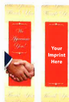
Thank You (THK)