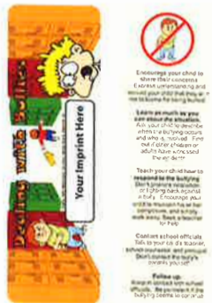
Dealing With Bullies (BUL)