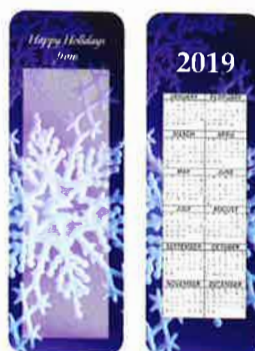
Holiday Snowflake (SNO)