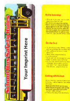
School Bus Safety Rule (BUS)